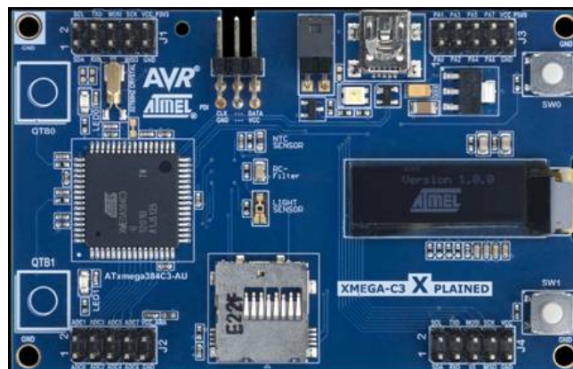
Figure 1. XMEGA-C3 Xplained evaluation kit.

The kit offers a larger range of features that enables the Atmel AVR XMEGA® user to get started using XMEGA peripherals right away and understand how to integrate the XMEGA device in their own design.