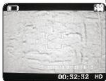
Motion-detect recording standby