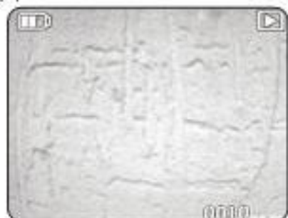
TV Video& Audio Playback_Photo