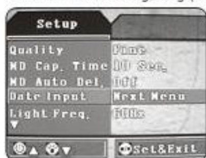
Time setting Step1

> After finish setting, long press "confirm button" save and quit the setting.