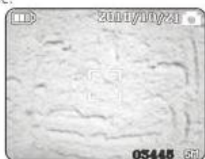
Motion-detect photo-taking standby