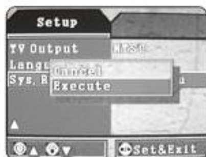
System reset step1

Illuminate: If you want to reset the system, choose "Execute", and short press "OK".