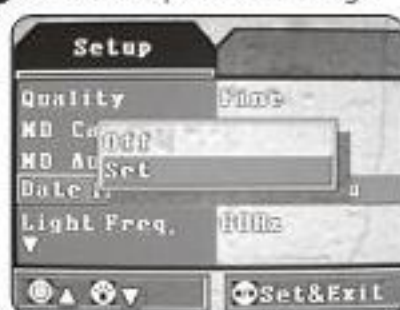
Time setting Step2