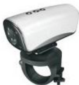
Use back clip together with stand