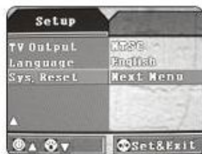
System reset step2