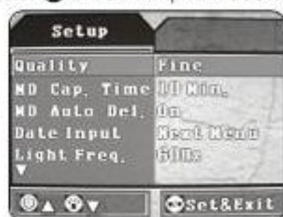
Enter into System setting