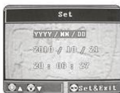
Time setting Step3