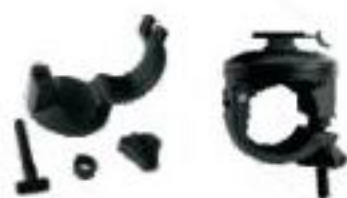
Install to stand