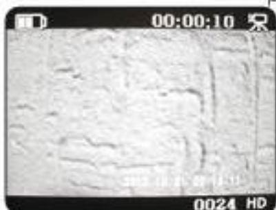
TV Video& Audio Playback_Video