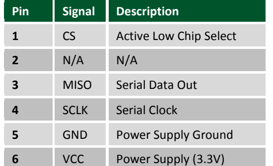
Table 3 below is the pin mapping of the output pins on the PmodTC1 that connect to a host board.